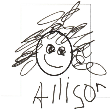
Drawing is outside template